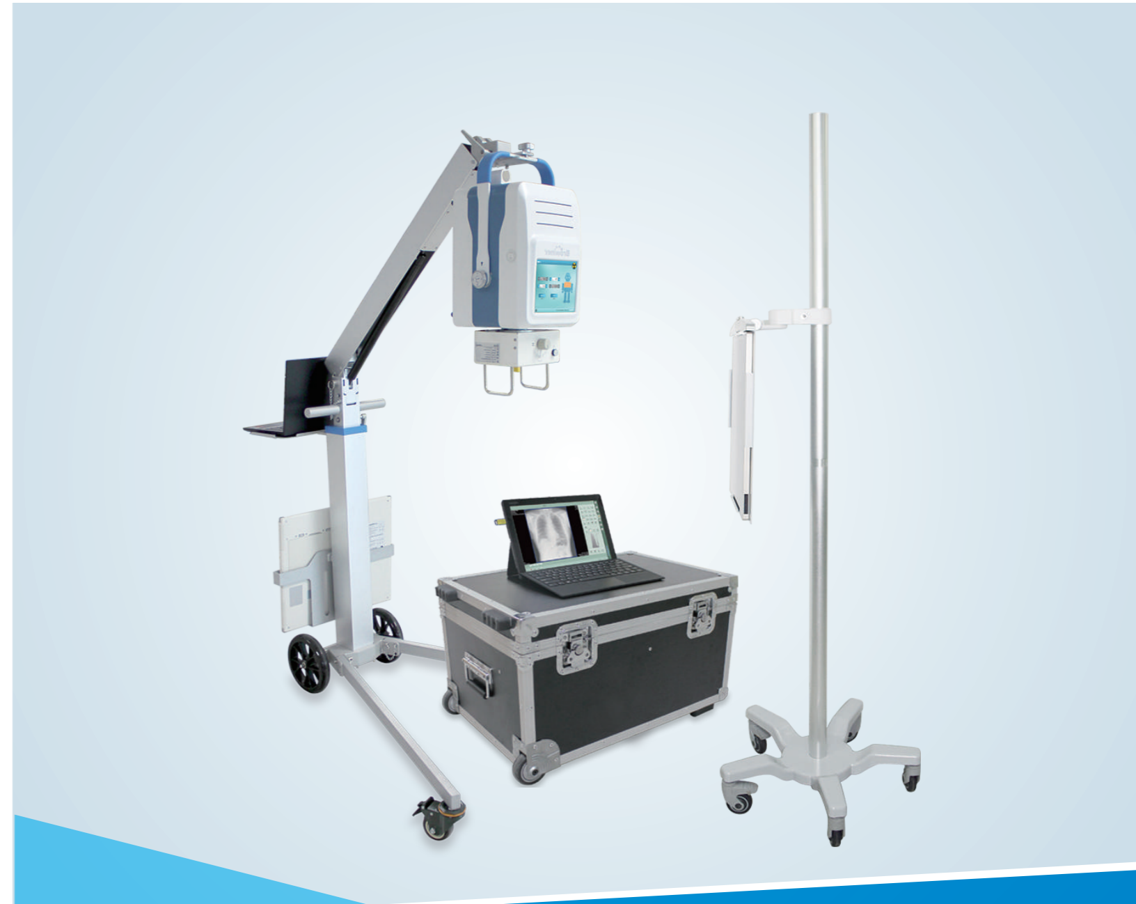
Beatle-05P Portable Digital X-ray System

This brochure includes standard & optional configuration, we do not guarantee that the optional configuration would be included in the product of your choice.